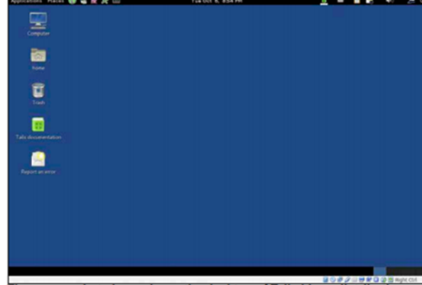
The screen-shot above shows the desktop of Tails Linux distribution.

Yes, Tails is Linux, but as the screen-shot here shows, its graphical interface should be familiar to almost any computer user. The most commonly-used applications are available on the menu bar at the top, and the rest reside in the Applications menu. As always though, you should experiment with it at home before you really need it.